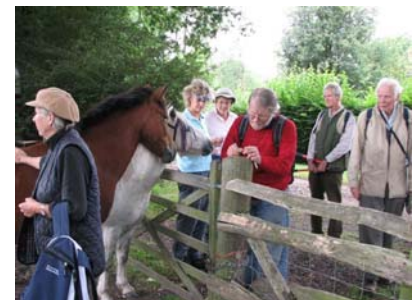
Our ROW team carrying out way-marking tasks - overseen by the 'Neigh-bours'

Another invasive creature in gardens/woodlands is a large black beetle which grows to 37 mm long. If found please place in a container and contact the local Plant Health Seeds Inspector on Defra website or contact Cllr Park for telephone number. It is very destructive to trees and plants and has been brought on imported Acers from China and distributed by mail order.